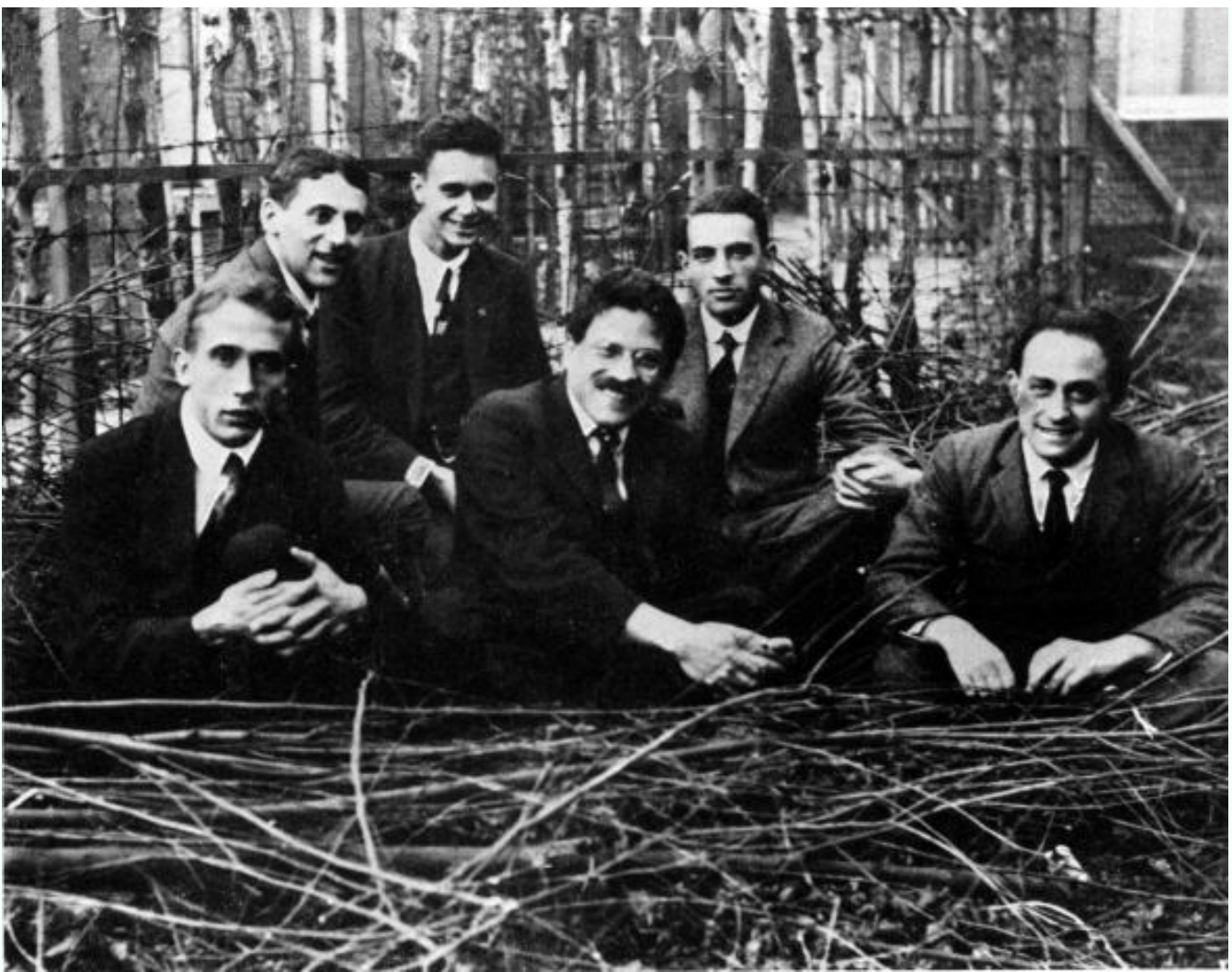
Leiden 1924. From left to right: Dieke, Goudsmit, Tinbergen, Ehrenfest, Kronig, Fermi. Note: Tinbergen later changed from physics to economy and became the first Nobel laureate in economy (1969).

So Uhlenbeck knew nothing about the new physics, but yet he did an important thing for the modern physics that was to come. Ehrenfest had written him a letter in which he said: "I have read an article by a young man, it looks nice and one ought to try and see him". Well, in those days, when your professor wrote you, you did it. And George Uhlenbeck went to see that young man; the young man just came back from Germany and was totally discouraged. He had spent a semester in Göttingen and there they had given him a treatment: "Well that man cannot know anything, besides being too small he never studied anywhere worthwhile". So the young man really got discouraged and meant to give up physics. But Uhlenbeck said: "Don't do that before you first talk to Ehrenfest; come and see Ehrenfest." And the man came to Leiden and stayed for two or three months with Ehrenfest, of which I can show a picture. A well-known picture that you may have seen before: there is that young man, Enrico Fermi. And under Ehrenfest's encouragement it dawned on him that he really was a competent physicist. And if you look at Fermi's career ..... those are the days in which he really became a great physicist.